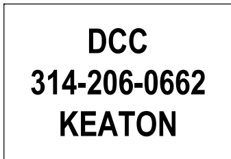
DCC SIGN NO SCALE