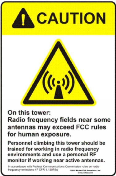
MPE RADIATION SIGN 2 NO SCALE