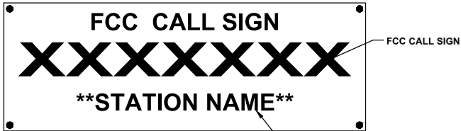
FCC CALL SIGN NO SCALE