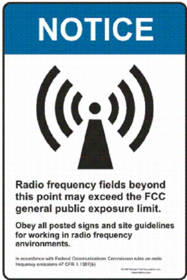
MPE RADIATION SIGN 1 NO SCALE