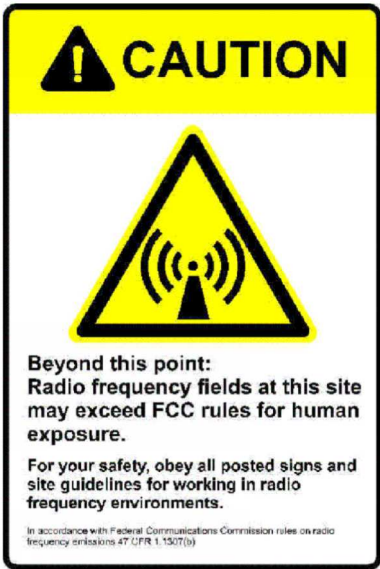
MPE RADIATION SIGN 3 NO SCALE