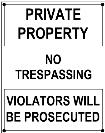
NO TRESPASSING SIGN NO SCALE