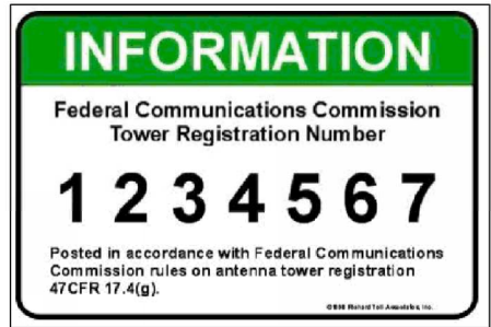
FCC ANTENNA STRUCTURE REGISTRATION NO SCALE