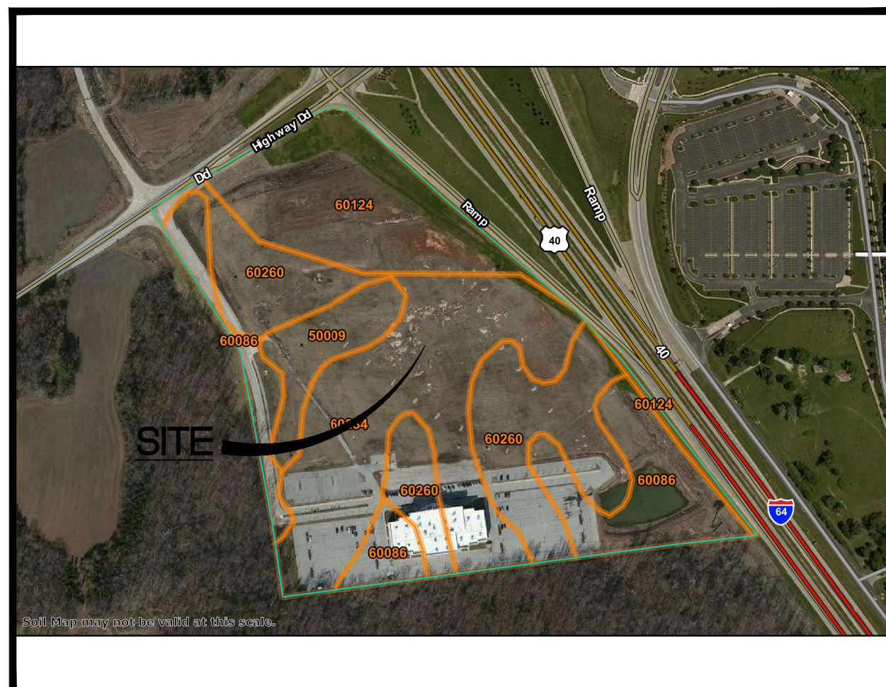
SOILS MAP (NOT TO SCALE)