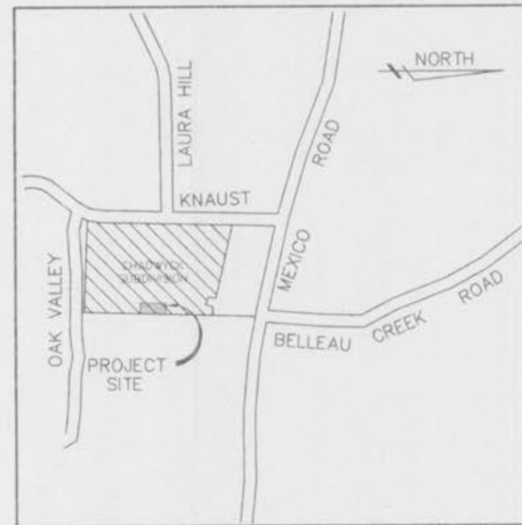
NOT TO SCALE LOCATION MAP