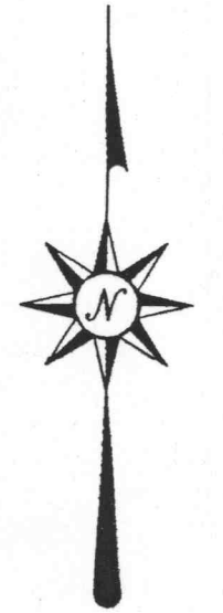
LANDSCAPE PLAN Scale: 1" = 50'