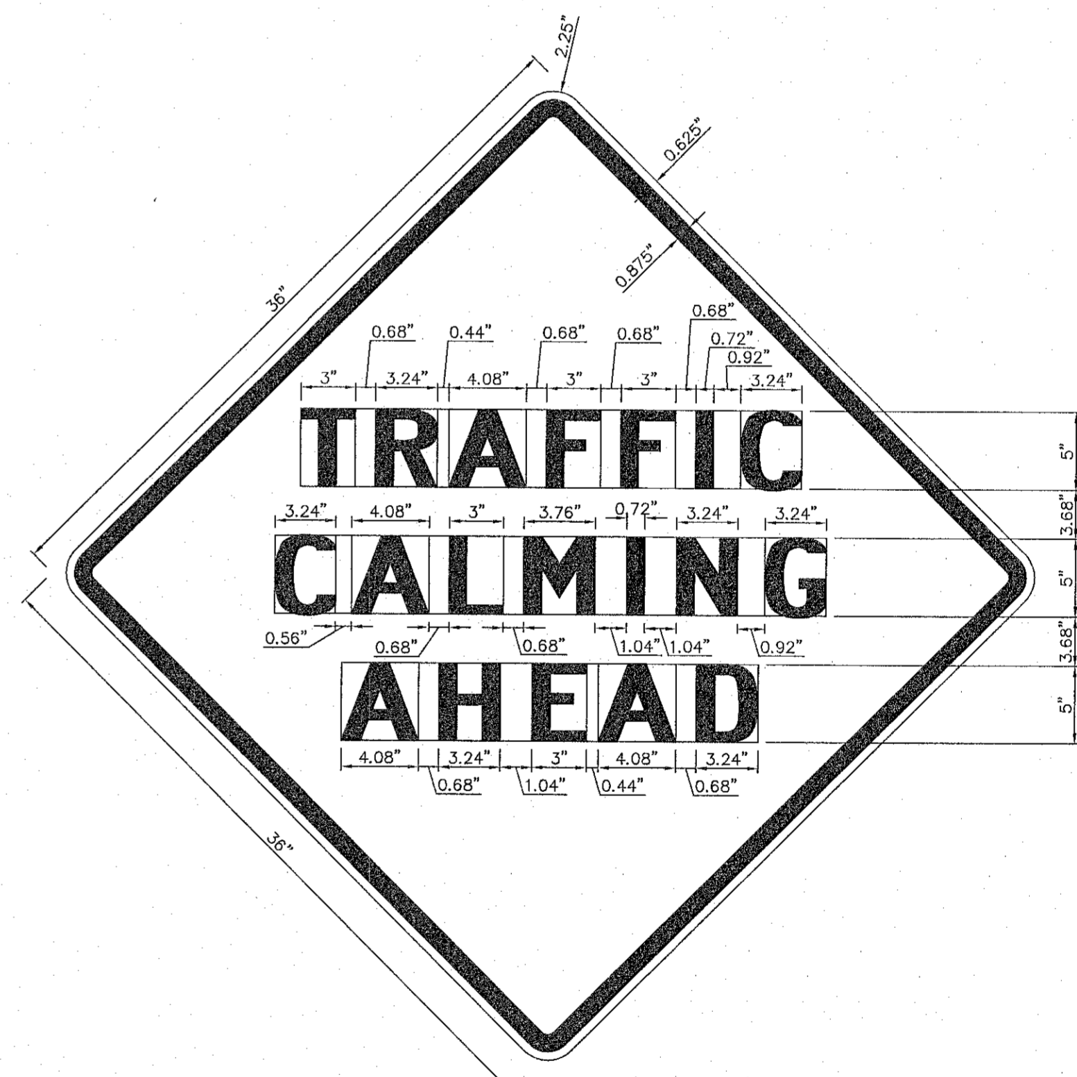
SPECIAL SIGN DETAIL NOT TO SCALE

UNDERGROUND UTILITIES HAVE BEEN PLOTTED FROM AVAILABLE INFORMATION AND THEREFORE THEIR LOCATIONS SHALL BE CONSIDERED APPROXIMATE ONLY. THE VERIFICATION OF ALL UNDERGROUND UTILITIES, EITHER SHOWN OR NOT SHOWN ON THESE PLANS SHALL BE THE RESPONSIBILITY OF THE CONTRACTOR, AND SHALL BE LOCATED PRIOR TO ANY GRADING OR CONSTRUCTION OF THE IMPROVEMENTS.