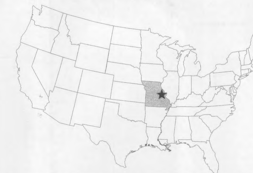
STATE LOCATION MAP