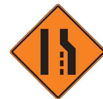
W4-2R "RIGHT LANE ENDS" SIGN NOT TO SCALE