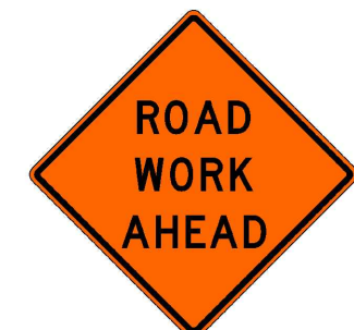
W20-1 "ROAD WORK AHEAD" SIGN NOT TO SCALE