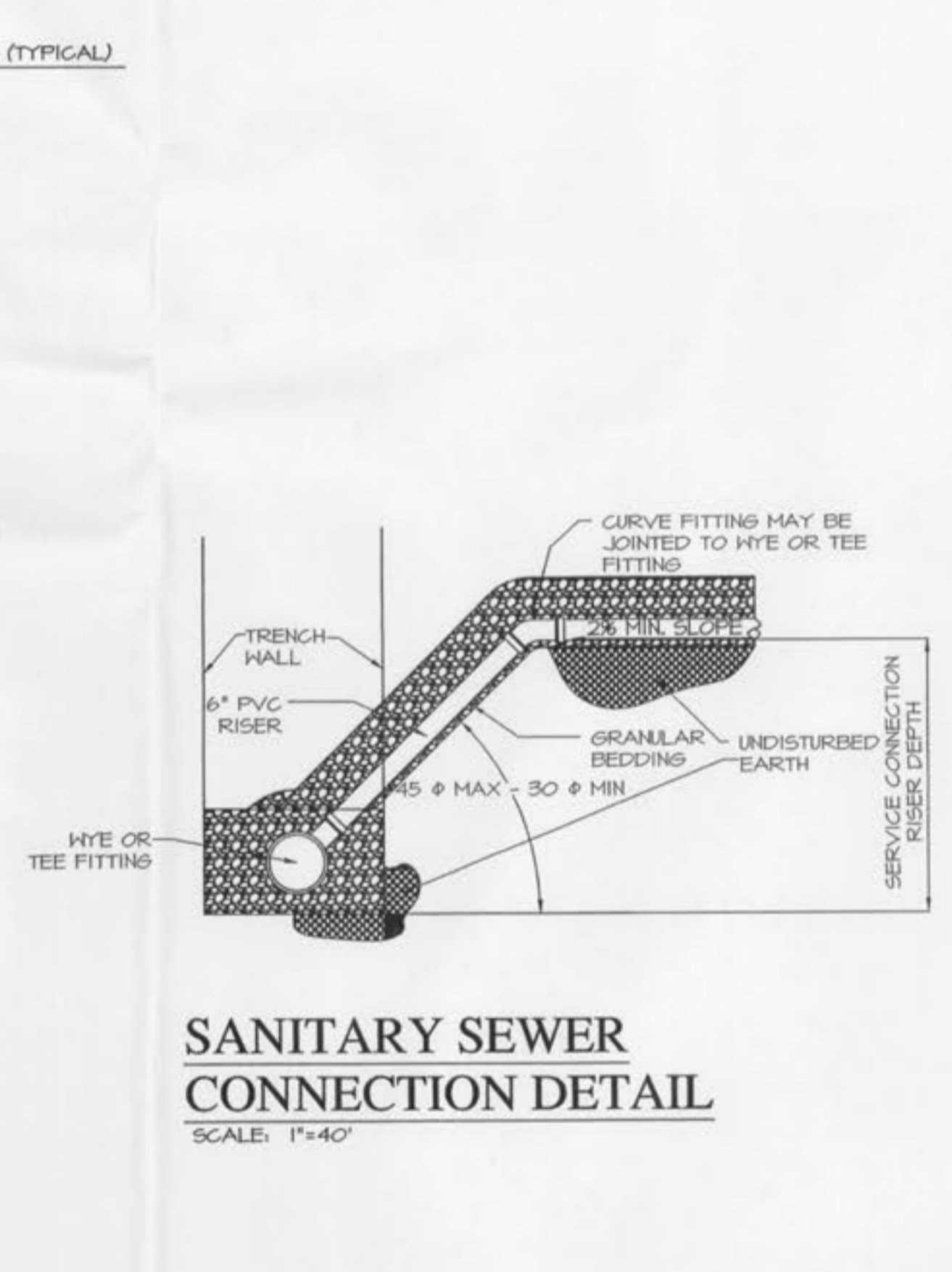
SANITARY SEWER CONNECTION DETAIL SCALE: 1" = 40'

NOTE: ALL SANITARY SEWER TRENCHES TO BE BACK FILLED WITH GRANULAR FILL UNDER ALL PAVEMENTS AND WITHIN 1:1 SHEAR PLANE SLOPE OF THE PAVEMENT EDGE.