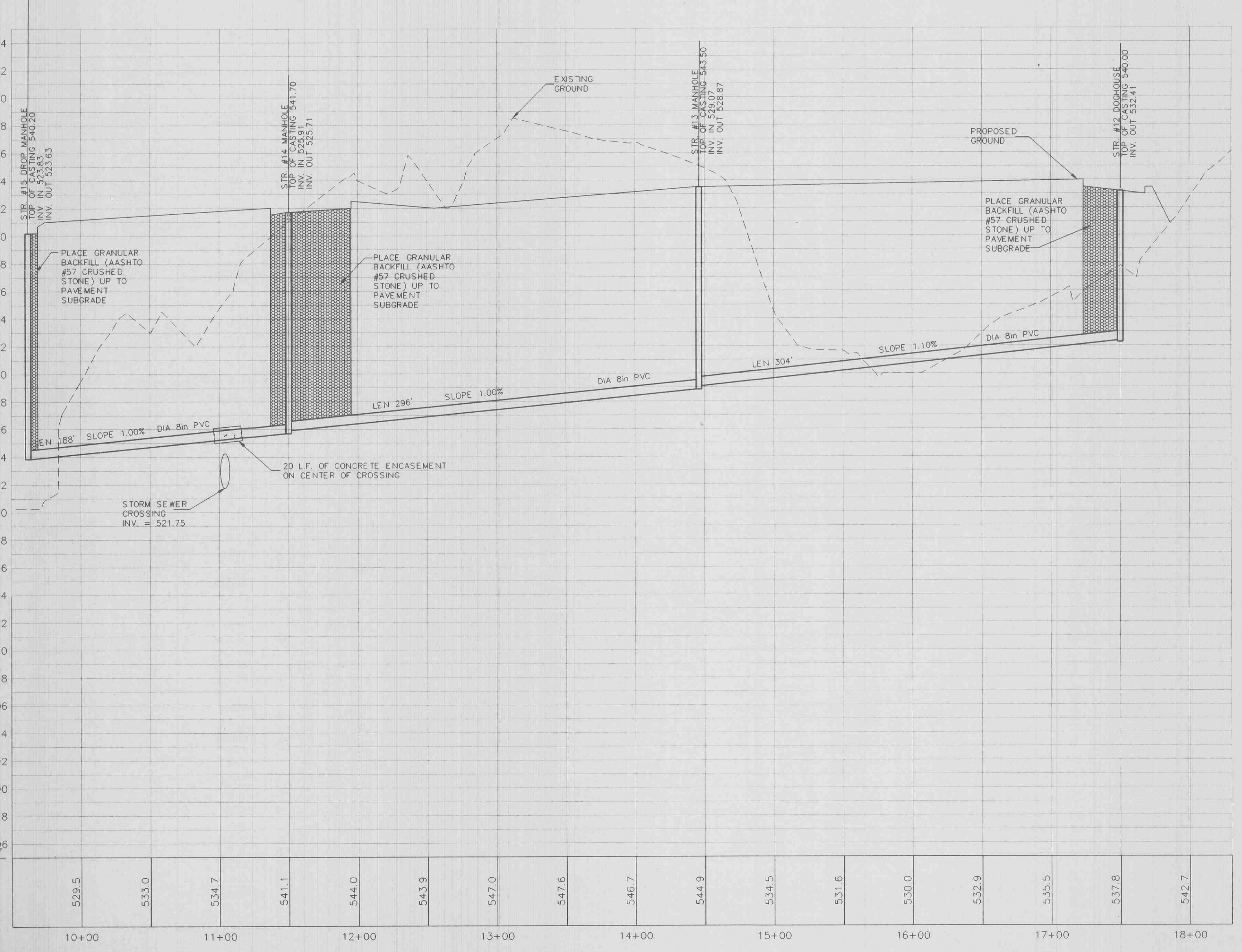
MANHOLE #15 THRU #19 TO #11

VERTICAL SCALE: 1" = 5' HORIZONTAL SCALE: 1" = 50'