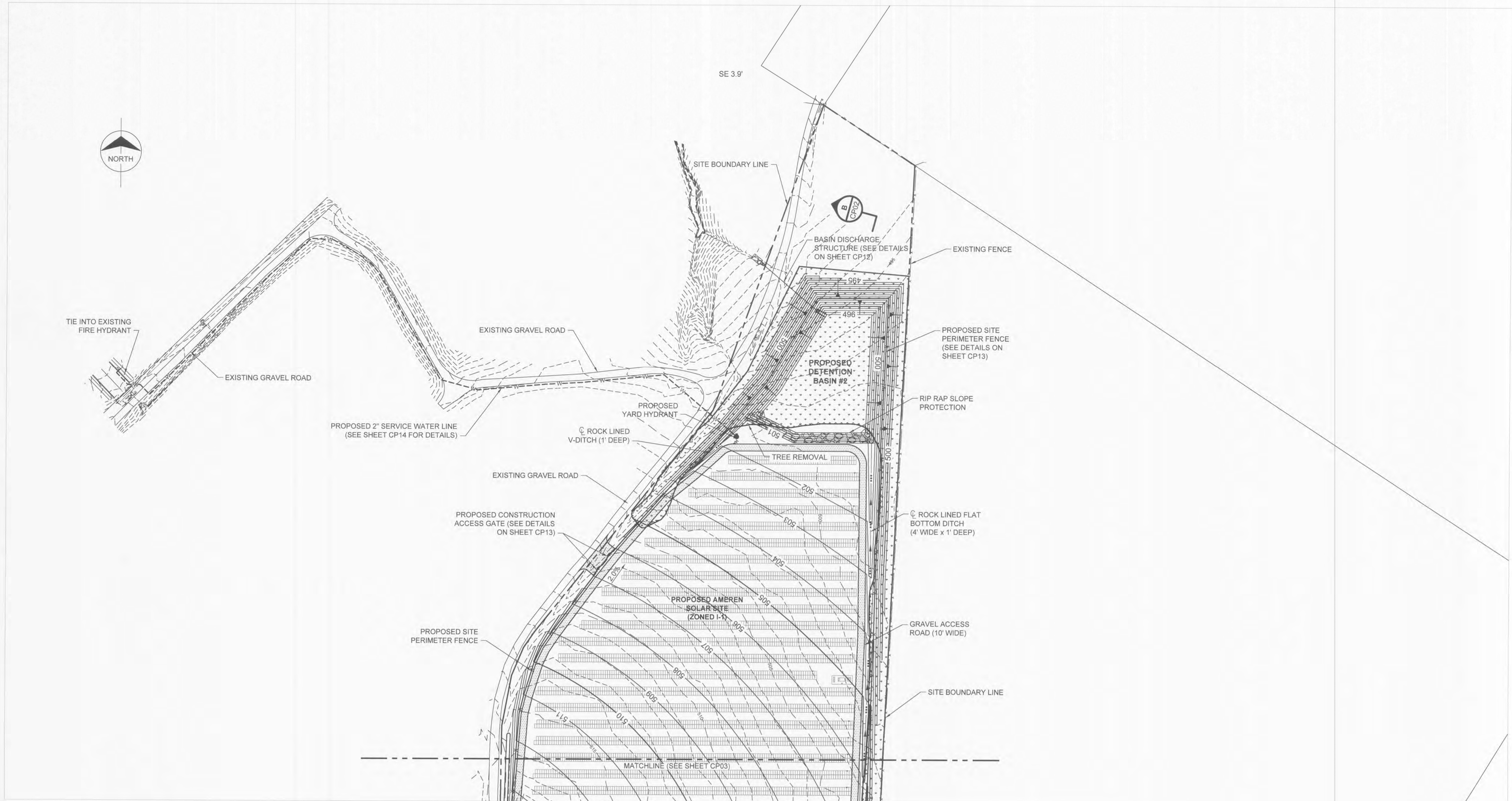
CIVIL GRADING PLAN