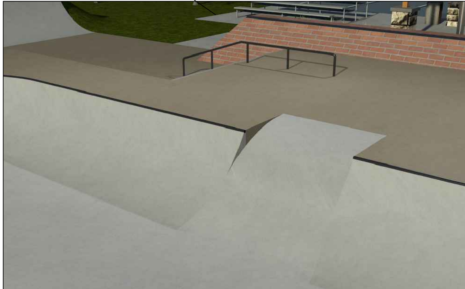
SKATEPARK COMPUTER MODEL VIEW *COMPUTER MODEL FOR GENERAL REFERENCE ONLY, SOME FEATURES MAY VARY