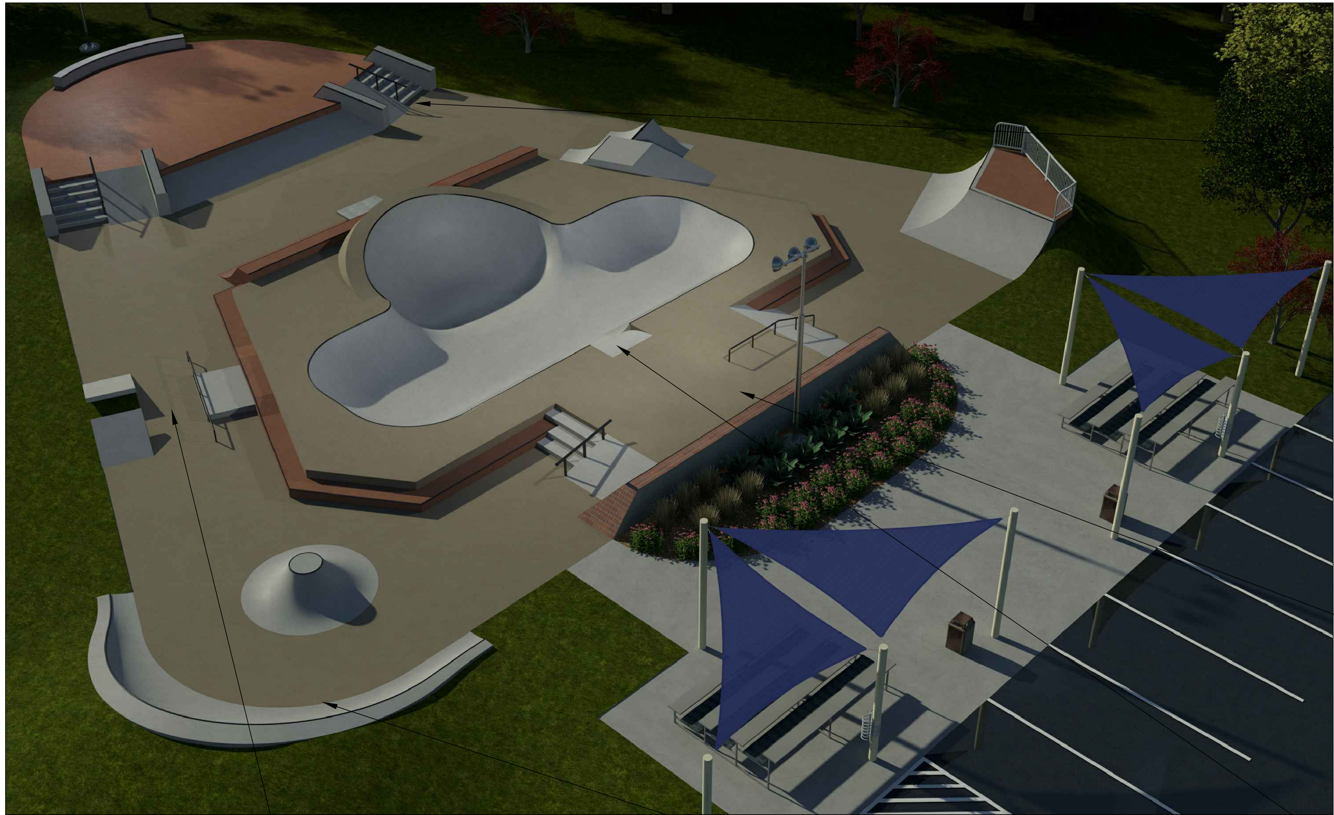
SKATEPARK COMPUTER MODEL VIEW

*COMPUTER MODEL FOR GENERAL REFERENCE ONLY, SOME FEATURES MAY VARY