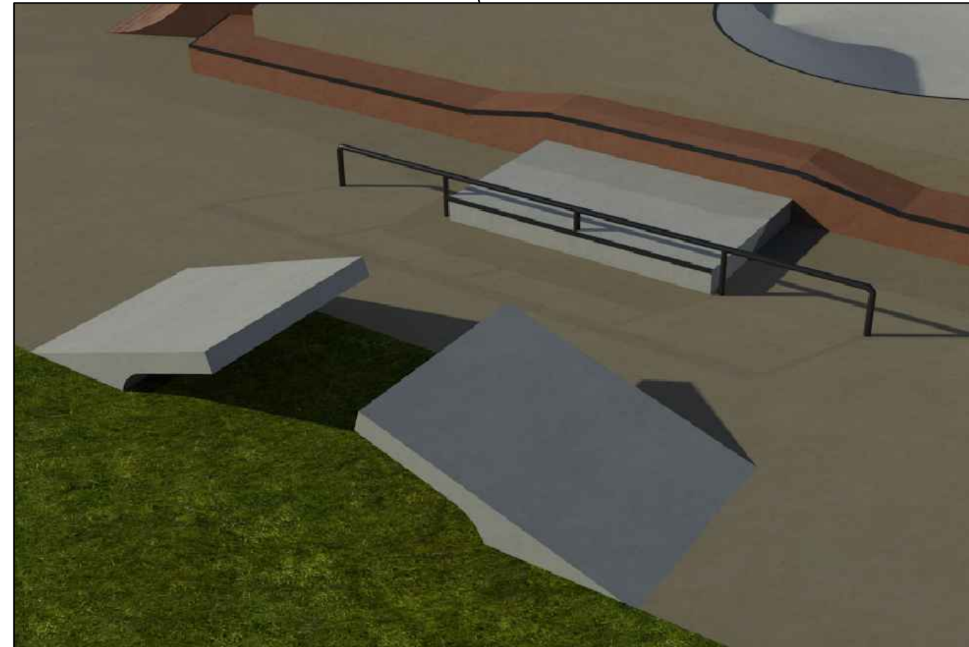
SKATEPARK COMPUTER MODEL VIEW *COMPUTER MODEL FOR GENERAL REFERENCE ONLY, SOME FEATURES MAY VARY