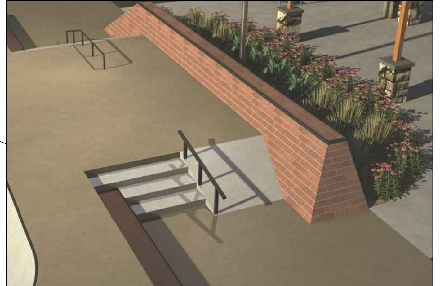
SKATEPARK COMPUTER MODEL VIEW *COMPUTER MODEL FOR GENERAL REFERENCE ONLY, SOME FEATURES MAY VARY