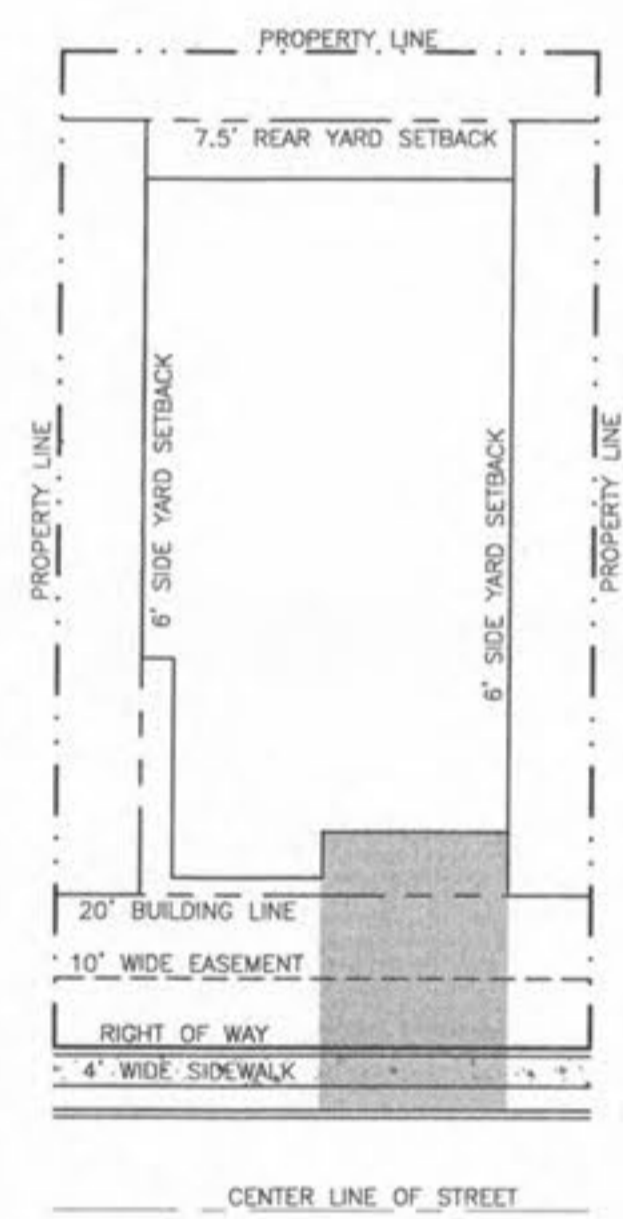
1 TYP. LOT DETAIL SCALE: N.T.S.