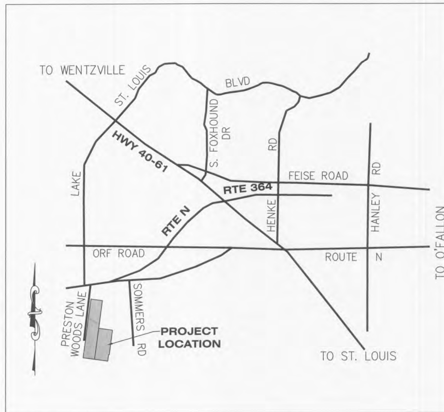
LOCATION MAP SCALE: 1" = 1000'