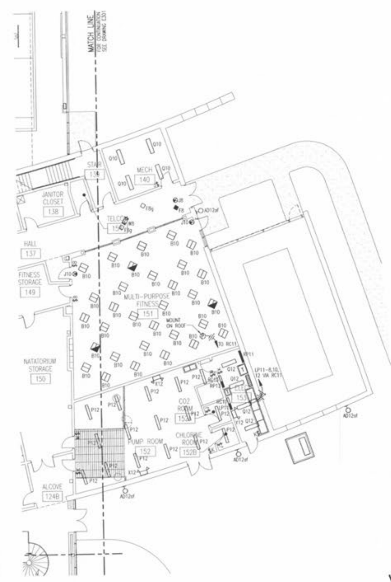
A4 FIRST FLOOR EAST LIGHTING PLAN E302 1/8" = 1'-0"