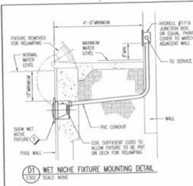
D1 WET NICHE FIXTURE MOUNTING DETAIL E302 SCALE: NONE

Jacobs Project No: F0W43600 Drawing Title: ELECTRICAL FIRST FLOOR SOUTH-EAST LIGHTING PLAN Date: DECEMBER 9, 2002 Designed By: S. WENIGER | Drawing No: Drawn By: S. WENIGER | Checked By: F. HERRIT | E302