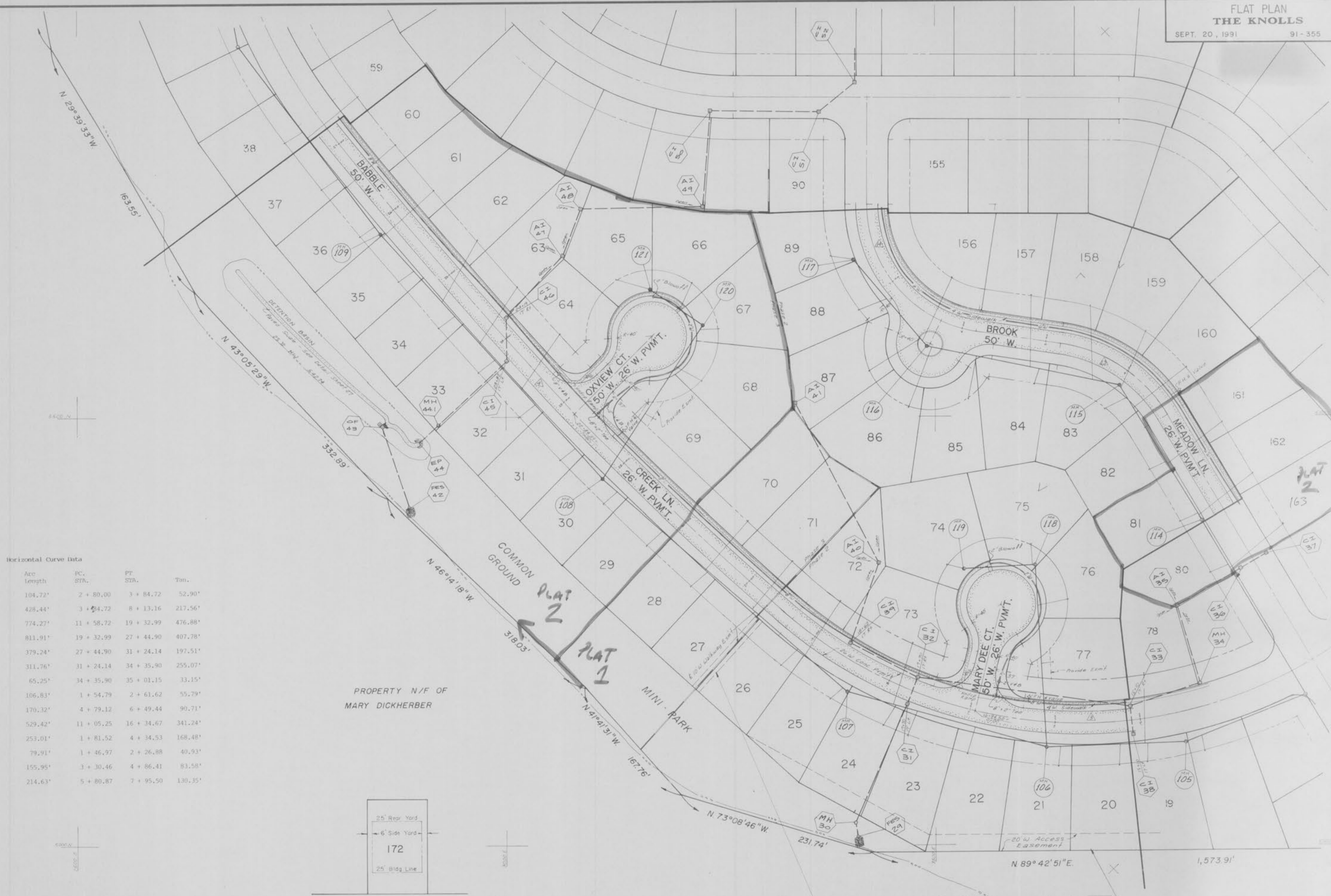
Horizontal Curve Data