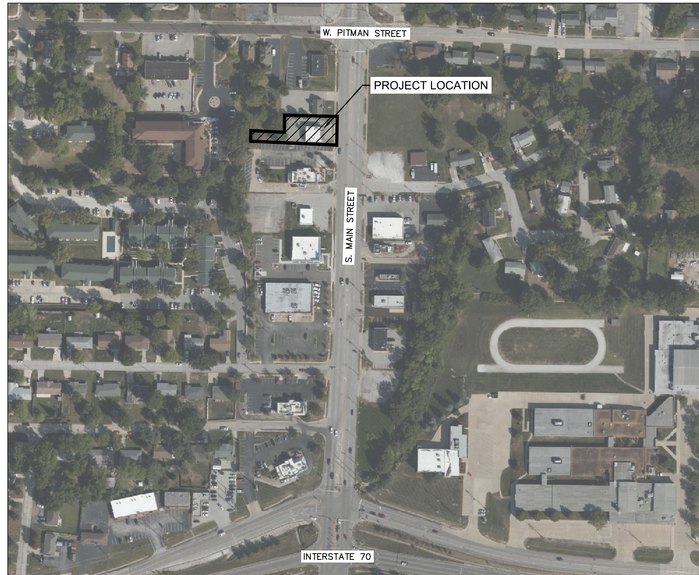
VICINITY MAP SCALE: 1"=200'