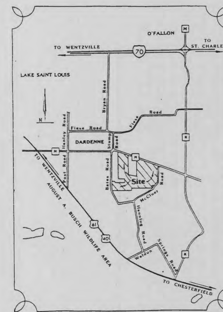
LOCATION MAP N.T.S.