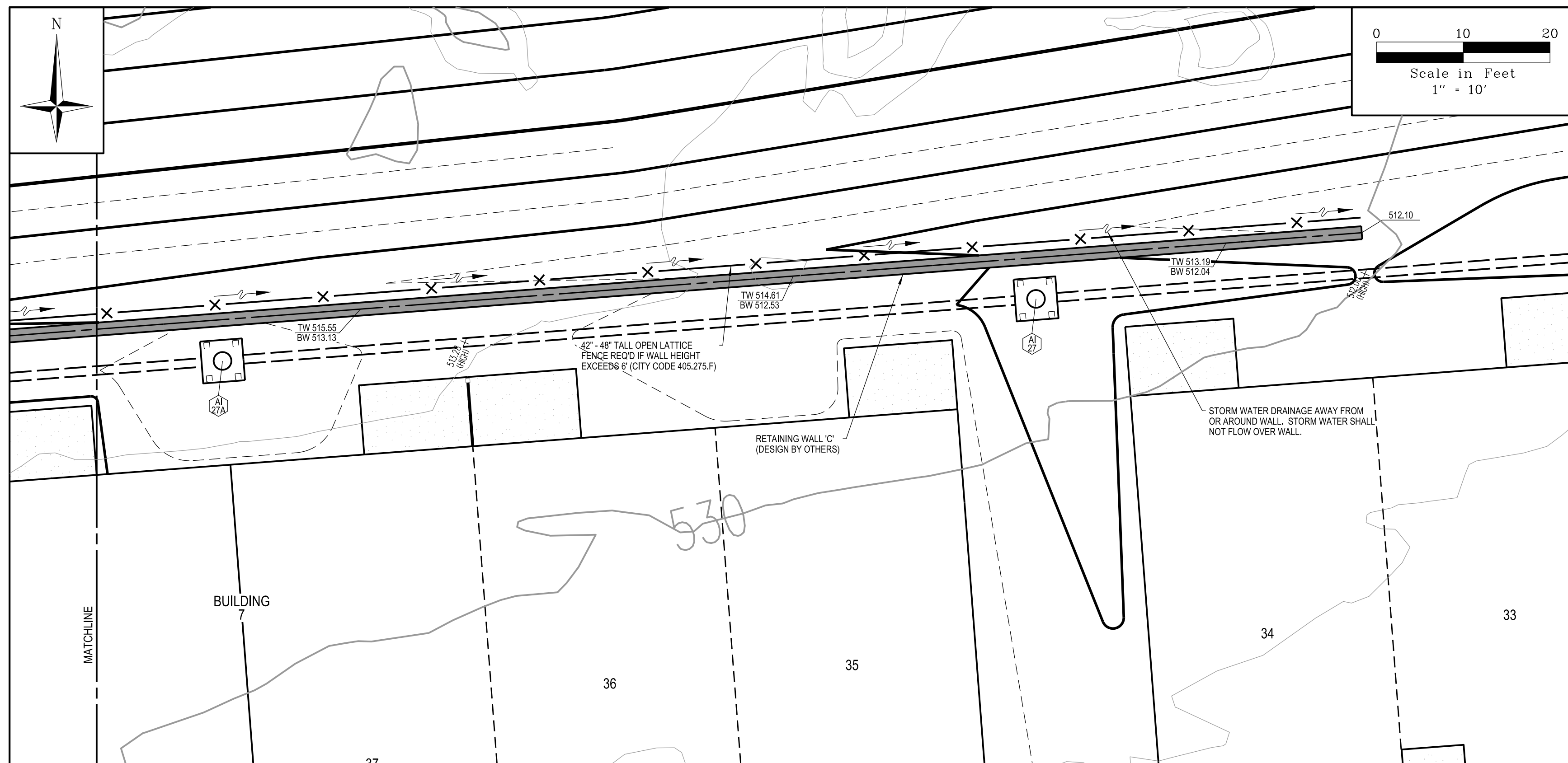
RETAINING WALL 'C' PLAN (2 OF 2)