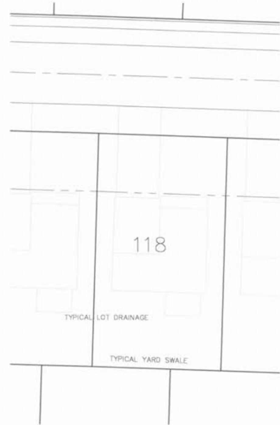
TYPICAL LOT DRAINAGE NOT TO SCALE