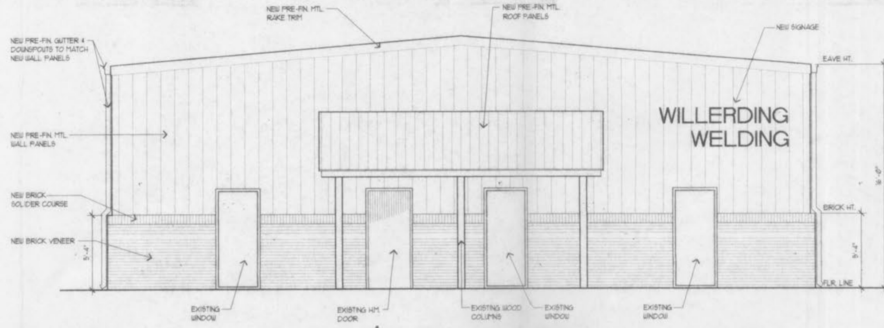
1 FRONT ELEVATION 1/4" = 1'-0"

Per the attached letter from LePique & Orne the brick height will match the colored building elevation's approved by the Planning & Zoning Commission.